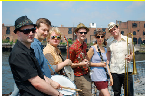
Red Hook Ramblers

Thur, May 5 Cinco de Mayo Preview Party/Fundraiser 6:30 – 9:00PM