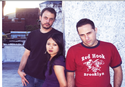
Red Orange Morning

their music is moody, sad, angry, passionate, and intense - the end result is a rhythmic and melodic collage.